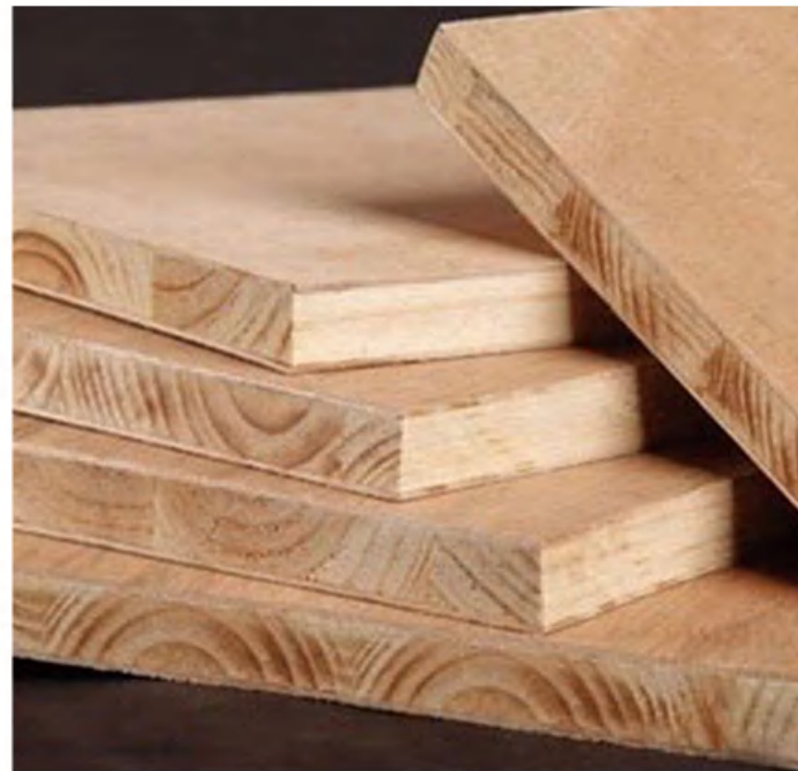
Furniture and wood