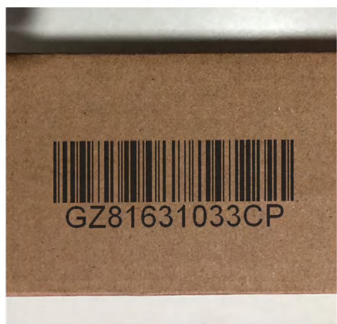
Dynamic security barcode