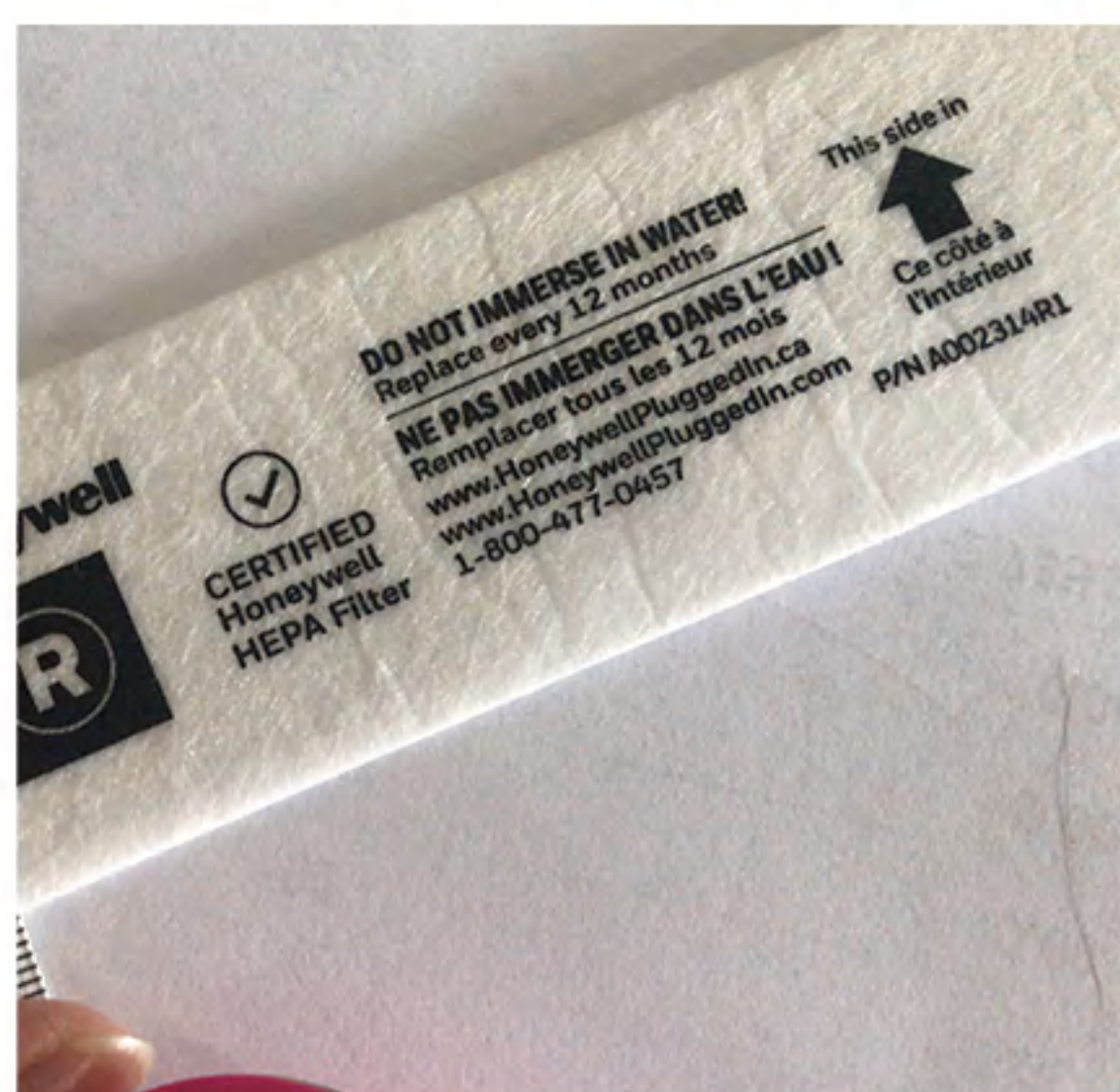
Multi- group printing