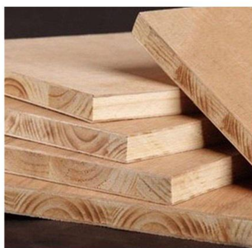
Furniture and wood