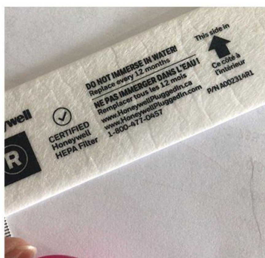
Multi- group printing