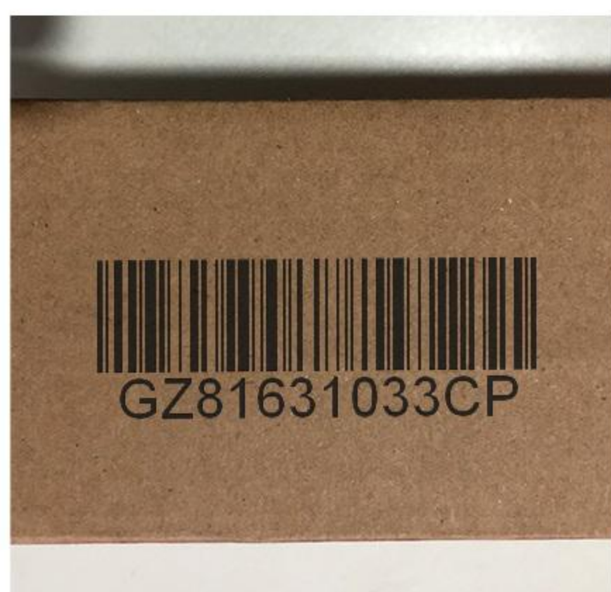
Dynamic security barcode