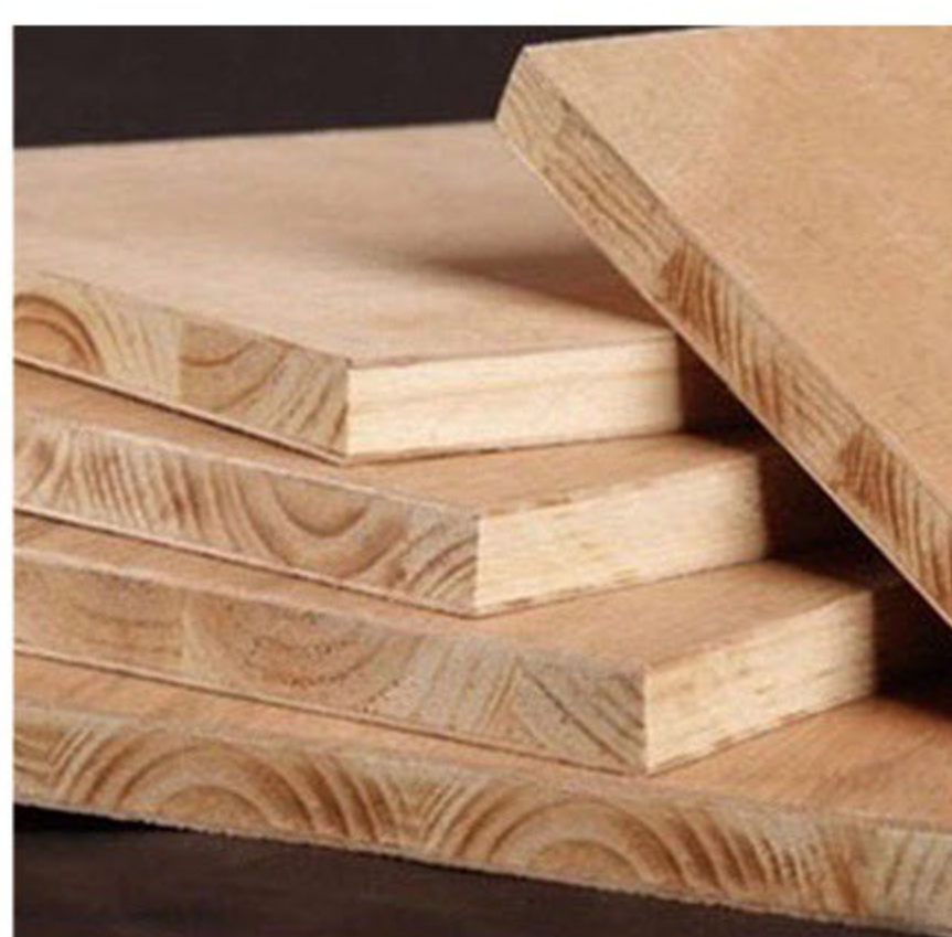
Furniture and wood