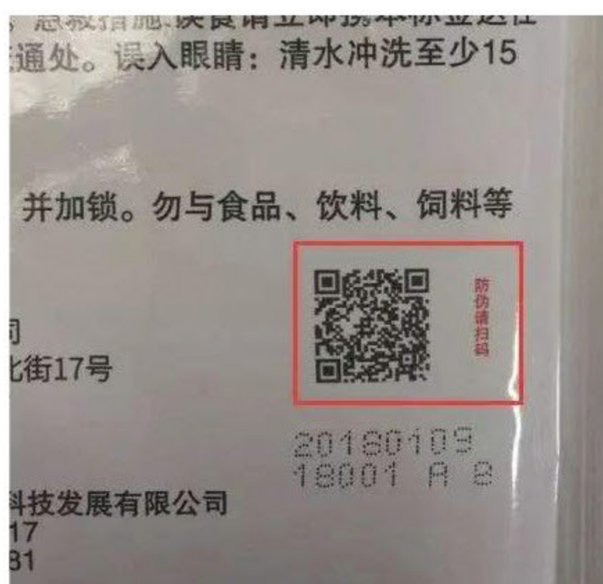
Dynamic trace QR code