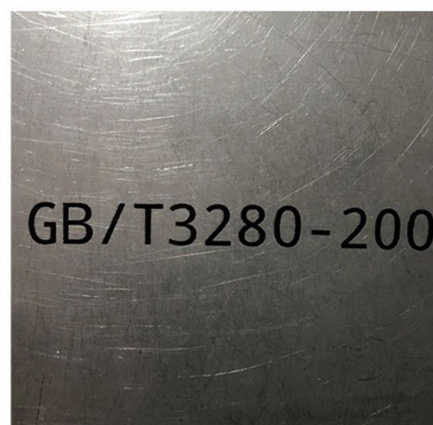
HD bold font