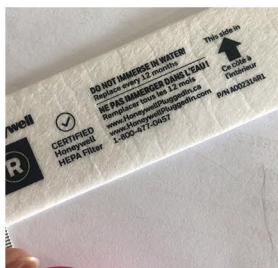
Multi- group printing