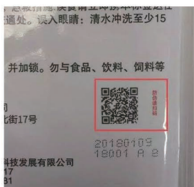
Dynamic trace QR code