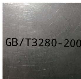
HD bold font