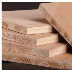
Furniture and wood