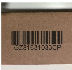
Dynamic security lable