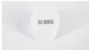
Daily chemical products