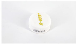
Food and beverage